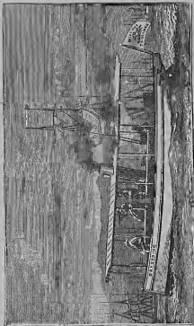
SEAMEN'S MISSION-STEAMER "DAYSPRING," HONG KONG HARBOUR.