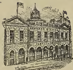
THE MISSIONS TO SEAMEN CHURCH AND INSTITUTE, SUNDERLAND.

Round 67. Knit 2, make 1, knit 14, make 1. Round 70. Knit 2, make 1, knit 16, make 1. Round 73. Knit 2, make 1, knit 18, make 1. Round 76. Knit 3, put the 18 thumb stitches on to a piece of yarn, finish the round plain. * Rounds 77 to 84. Knit plain. Rounds 85 to 92. Rib in twos as at the wrist, cast off loosely. Put the 18 thumb stitches on to three needles, 6 on to each, knit up 2 new stitches at the opening, knit 6 rounds plain, rib 6 rounds in twos, cast off loosely.