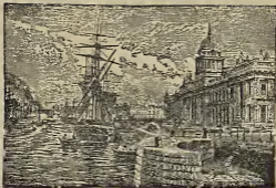
THE MISSIONS TO SEAMEN ON THE LIFFEY.

42. Alternately knit 2 and purl 2. This head piece, including the ribbing for the forehead, should be about 6\frac{1}{2} inches long. In the next round on the first needle knit 2, put these back on to the third needle, this will put a rib at each side of the face; cast off 30. Continue ribbing the 66 stitches for 9 rows, about 1 inch. Then cast on 30, replace the 2 stitches on to the first needle, continue ribbing the 96 stitches for 100 rounds, cast off very loosely. —HENRIETTA WARLEIGH.